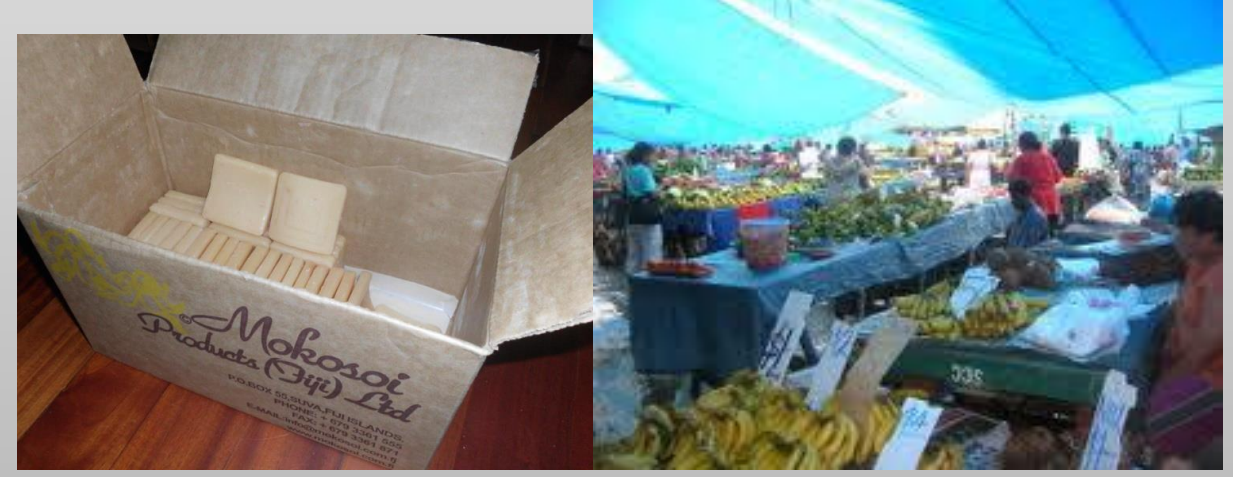
LOCALLY PRODUCED SOAP

With consumable goods, every effort will be made to find more products which are available in bulk supply and to replace canned products with fresh produce when possible; non-recyclable containers, such as alcoholic beverages will be replaced by recyclable packaged products e.g. cider bottles have been replaced by recyclable aluminum canned cider.