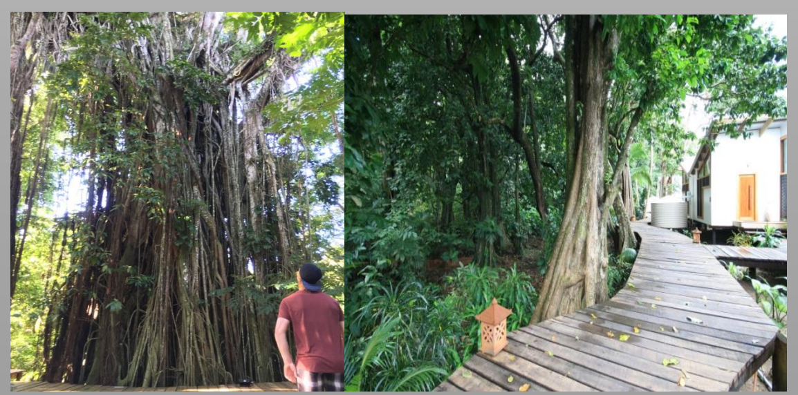
OUR BAYAN TREE IN THE HEART OF THE RESORT