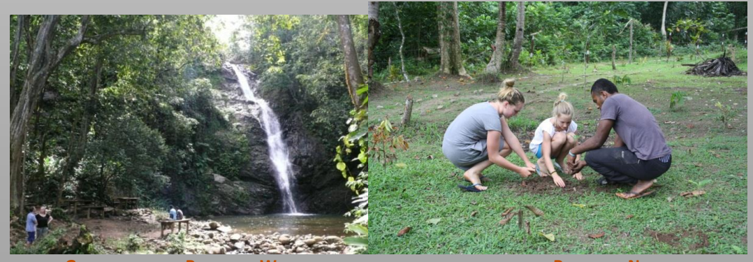
GUESTS VISITING BIAUSEVU WATERFALL AND PLANTING A TREE AT THE BIAUSEVU NURSERY

For example, Matanivusi facilitates visits to Biausevu Waterfall, which is a significant historical/cultural site for the local villagers of Biausevu. The village uses admission fees and donations for conservation work around the waterfall and for projects in the village. Guests often participate in planting a tree at the Youth Tree Nursery located along the walk to the waterfall. Once advanced, the trees are sold and proceeds go toward youth group initiatives.