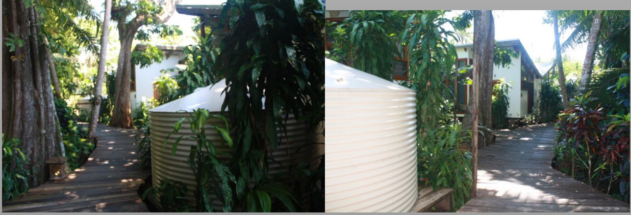
RAINWATER TANKS OUTSIDE EACH RESORT ROOM

Matanivusi employs various water saving measures, such as only dry sweeping decks, paths and walkways, and only washing linen/towels when necessary. All toilets at the resort are dual flush and use less than 6L per flush.