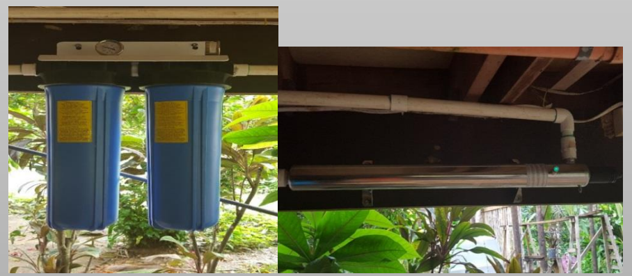
Our water filtration and UV treatment system

The resort has a UV treatment and water filtration system to further enhance the quality of the water provided.