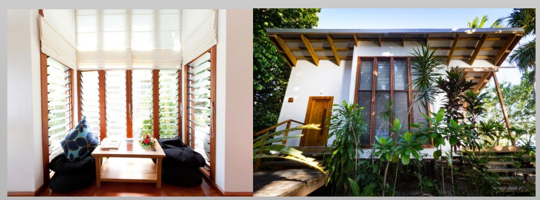
Passive Solar Design in one of our Bures

• Rainwater collection has been built into the design. All roof tops at the resort are designed to collect rainwater and there are numerous large rainwater tanks located throughout the resort. Except in unusual periods of extended dry weather, Matanivusi is self-sufficient in regards to fresh water, provided that staff and guests adopt a conservative approach to water use. Numerous water saving features have been incorporated into the design of the resort. For example, there are signs informing guests about conserving water in each guest bathroom, toilets have dual flush and use less than 6L per flush. Bar and Kitchen staff also collect water in basins for the washing of utensils and dispose of the waste water onto the herbs growing in pots around the facility.