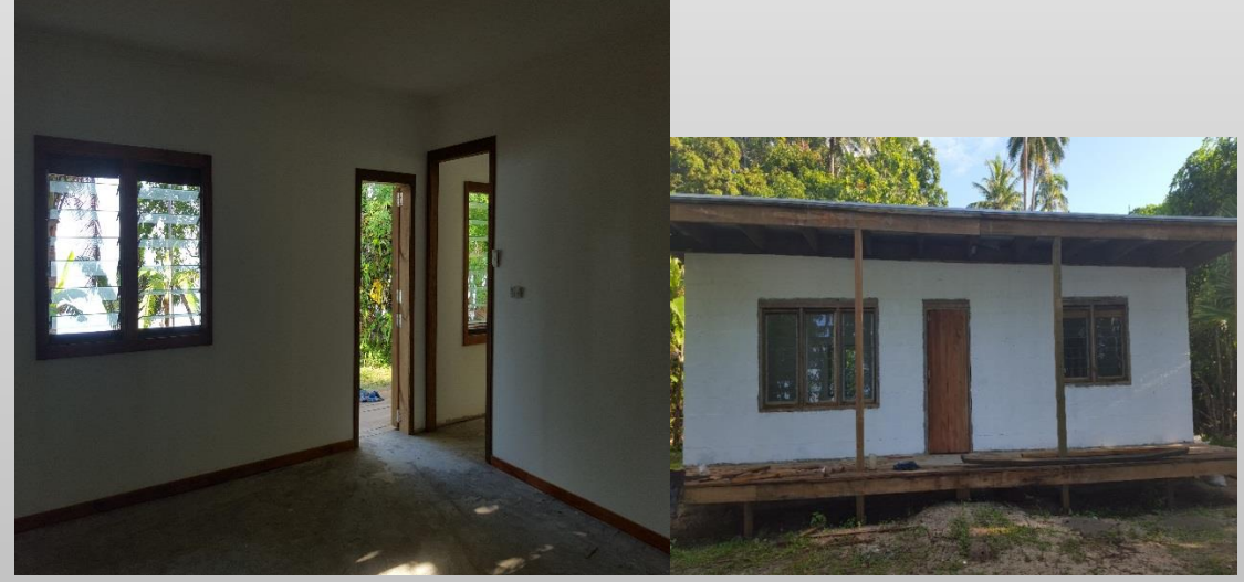
N EWLY BUILT HOUSE FOR RESIDENTS NEXT DOOR

• Local residents have not been displaced involuntarily or without compensation to make way for the development. Housing has been built for nearby residents.