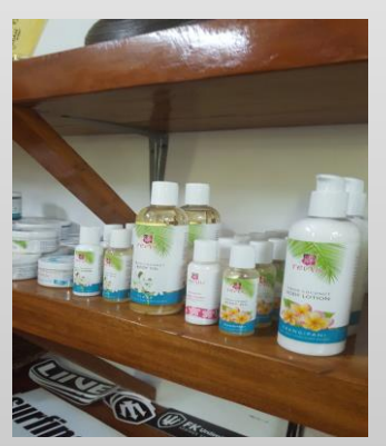
MASI OF DIFFERENT PRINTS AND LOTIONS AND OILS MADE LOCALLY SOLD IN GIFTSHOP

The resort facilitates visits to various Fijian owned and operated tourism activities and complementary businesses, such as Rivers Fiji (white water rafting), Kula Eco Park (Fiji's only wildlife park), Zip Fiji (zip-line tours) and Navua River Eco-Adventure (bamboo rafting and village visits). All recommended activities incorporate sustainability in their business model. A list of these complimentary businesses along with a list of recommended restaurants and a 'Sustainable Shopping' guideline can be found in the Activities Guide.