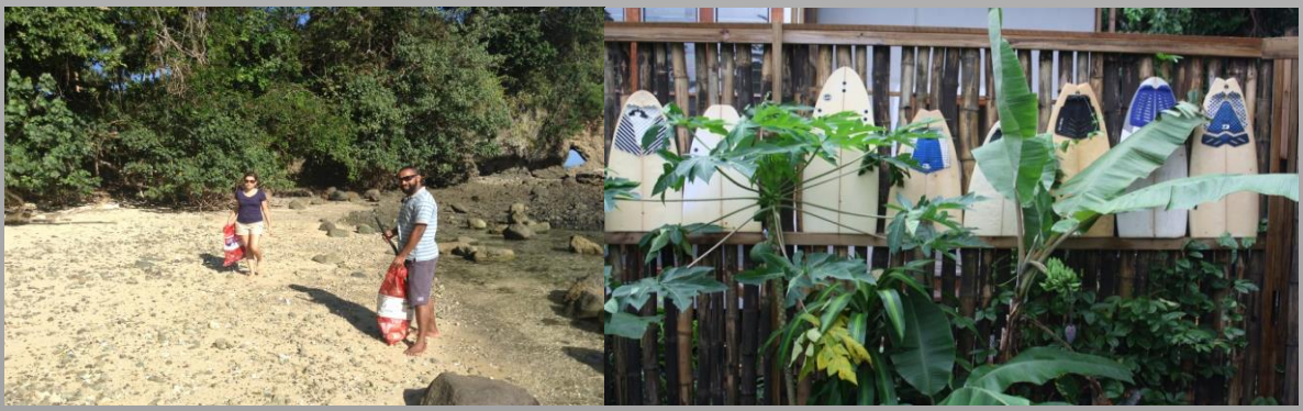
G UESTS ON OUR WEEKLY BEACH CLEAN-UP.

The resort undertakes a weekly beach clean-up in which guests are encouraged to participate. All collected rubbish is sorted and recycled where possible.