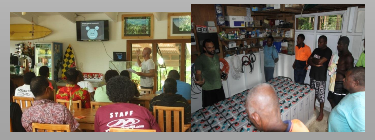
Staff Sustainability Training

Employees are encouraged to actively participate in devising new sustainability initiatives, and to pass on their knowledge to guests and their local community. This is our main priority going forward. We want to see the sustainable practices we've implemented introduced into our local Village of Vunaniu by our staff.