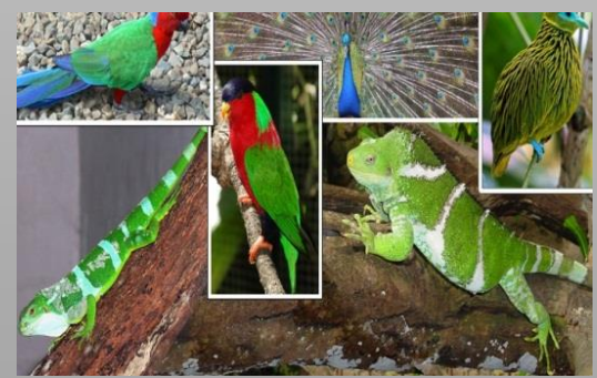
Kula Eco Park is the only Fijian Captive Breeding facility for endangered species

The resort facilitates visits to various Fijian owned and operated tourism activities and complementary businesses, such as Rivers Fiji (white water rafting), Kula Eco Park (Fiji's only wildlife park), Zip Fiji (zip-line tours) and Navua River Eco-Adventure (bamboo rafting and village visits). All recommended activities incorporate sustainability in their business model. A list of these complimentary businesses along with a list of recommended restaurants and a 'Sustainable Shopping' guideline can be found in the Activities Guide.