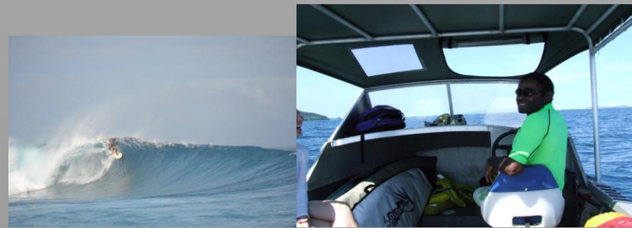
DAKAI AND EMORI IN ACTION OUT AT SEA