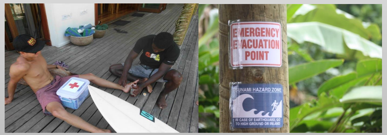
OUR STAFF ARE FIRST AID CERTIFIED AND EMERGENCY SIGNS INDICATE EVACUATION ROUTES AT THE RESORT

Procedures for medical emergency and evacuation, along with procedures in the case of earthquakes and tsunamis, are formalized into a written policy and communicated to all guests and employees. Employees undertake regular training and drills to ensure comprehension of these procedures. Guests are informed of their role in an emergency and of escape routes in the case of an earthquake or tsunami.