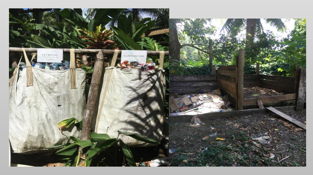
All proceeds from recycling are donated to the local kindergarten and compost is used for fertilizer

All rubbish is sorted into compost, recyclables and waste. Compost is used to fertilize our gardens. Recyclables are brought to a local recycling plant. The money generated from these recyclables is then donated to the Vunaniu Village Kindergarten. All non-returnable bottles are smashed and used as aggregate for concrete mix. Waste is weighed and then dropped off at a local landfill. We are actively setting goals and creating initiatives to reduce our waste.